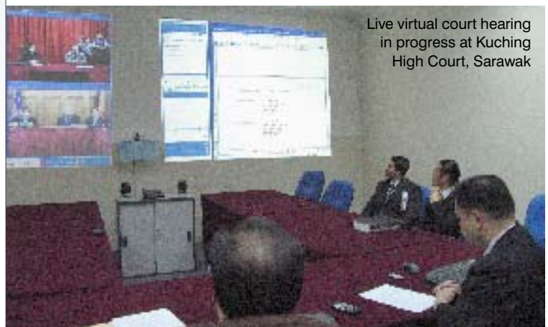
Live virtual court hearing in progress at Kuching High Court, Sarawak