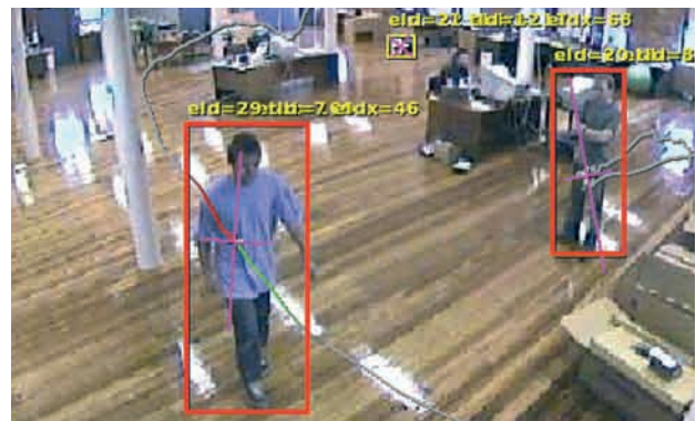
Screen showing detection of moving object.