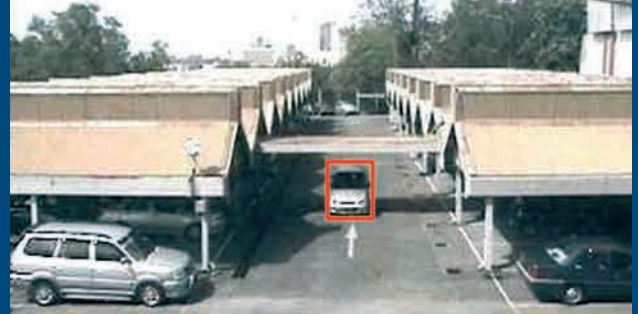
Screen showing detection of illegal entry

Signal an alarm if any object is moving in a different direction to expected flow