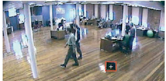
Screen showing detection of stationary object.