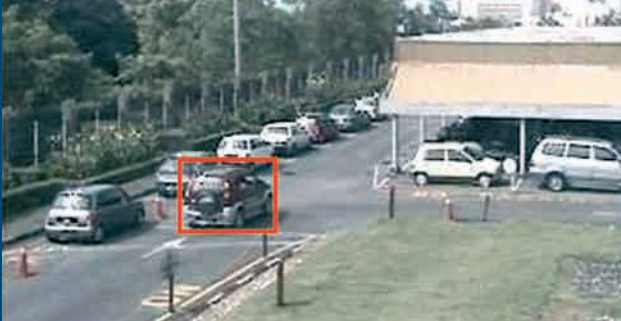
Screen showing detection of car speeding

Monitor and trigger alarm if any object exceeds the predefined speed