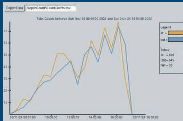
Screen showing counting report