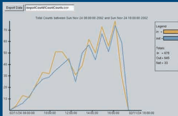
Screen showing counting report